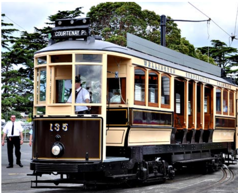
James Duncan watches as Paul Gourley brings 135 from the coachwork shop after its refurbishment, resplendent in a new coat of chocolate brown and transport ivory paint, and new signwriting.

The latest work involved a complete repaint in the chocolate brown and transport ivory colour scheme, as well as other work, including filling in some of the gaps in the original restoration.