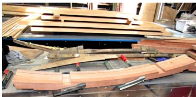
Totara roof bows being worked on in the MOTAT coachwork shop. Behind them are stacks of timber which will form other parts of the body frame.