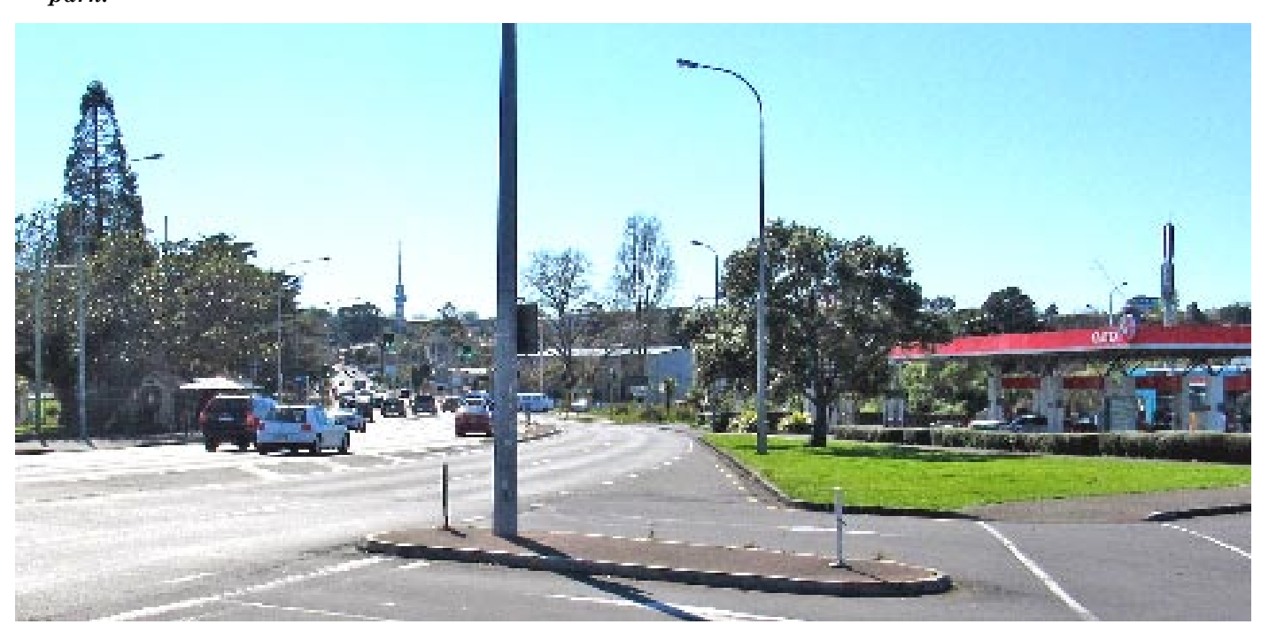
Page 6 - The Squeaky Wheel, MOTAT Society newsletter, Issue 28, January 2017

1930 class tram 237 heading east to "Owairaka via Hobson Street" has set off five passengers dressed in coats. A blow up of the photograph shows a family sheltering inside the building. That's an International pickup truck in front of the shelter, following a Triumph "bathtub" motorcycle and a 1939 Ford V8 sedan. Coming down the hill from Grey Lynn shops are another tram and a 1932 Ford V8 sedan, with a Morris 8 sedan parked on the right. In the foreground is the intersection of Great North Road and Western Springs Road. Today, the shelter overlooks the rump of the intersection, giving access to the Caltex service station and a car park.