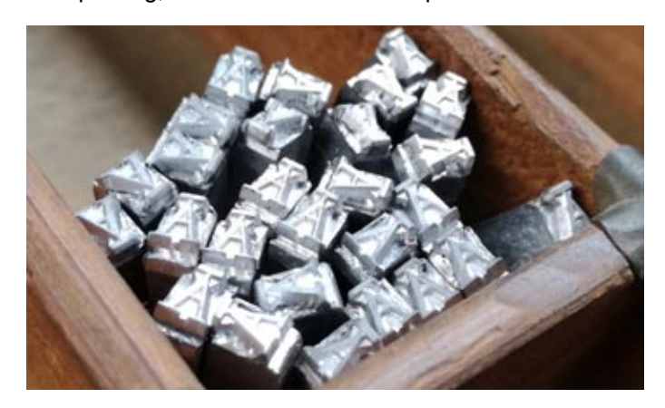
The capital A macron type, the macron being the line above the type.

Colenso did not like the use of macrons and at the time he was printing, the double vowel was preferred method of