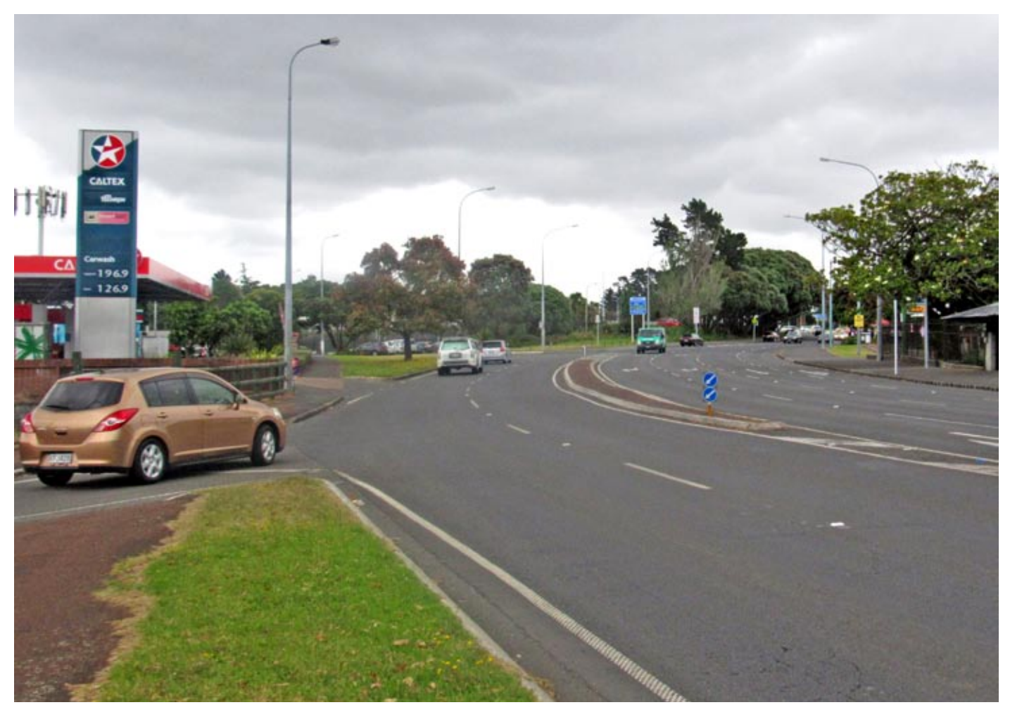
Page 7 - The Squeaky Wheel, MOTAT Society newsletter, Issue 28, January 2017

The shelter is still in the same place on the right, and the curvature of Great North Road is still there, but that's about it. The houses have gone, replaced by trees screening the North Western Motorway. That's M class tram 152 on its way to "Walker Road Pt Chevalier via Hobson Street". The MOTAT Pioneer Village has replaced the trees behind the shelter.