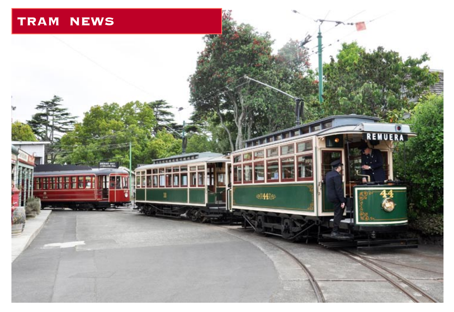
The three operable Auckland trams in the MOTAT collection on parade to mark the 60th anniversary of the closure of the tramway system on December 29 1956. They are, from front No. 44, built in 1906 to a 1902 design, No. 11, one of Auckland's first trams, and No. 248, one of the trams used in the final prade in 1956.