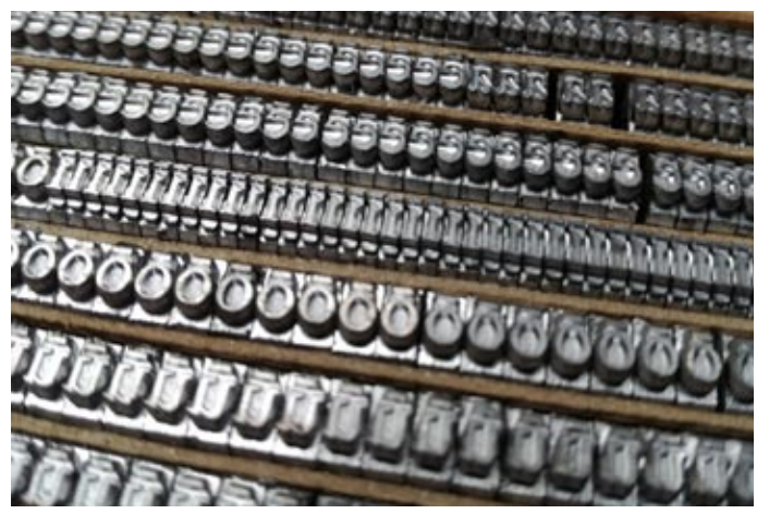
New macron type ready for distributing into the new typecases.

This project aims to bring NZ letterpress back to its origins. The longer term part of this project for MOTAT is to produce some Māori-language exclusive texts.