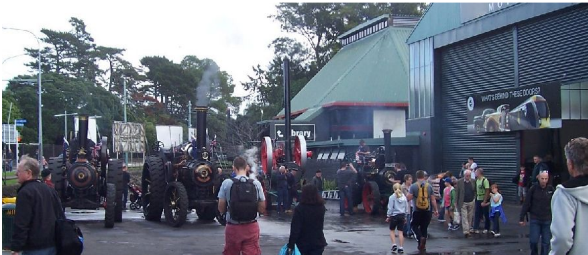
Line up of Steam engines at the MOTAT Steam Fair 26 th May 2013.

The weather cleared for the day of the Steam Fair, with more than 2700 visitors attending.