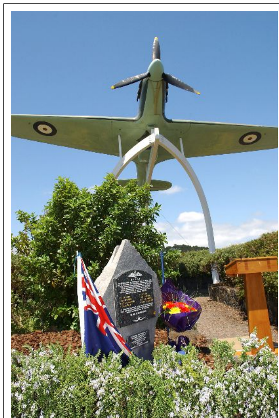
NZRAF Memorial under Sir Keith Park's Hurricane, MOTAT 2 – Anzac Day 2013