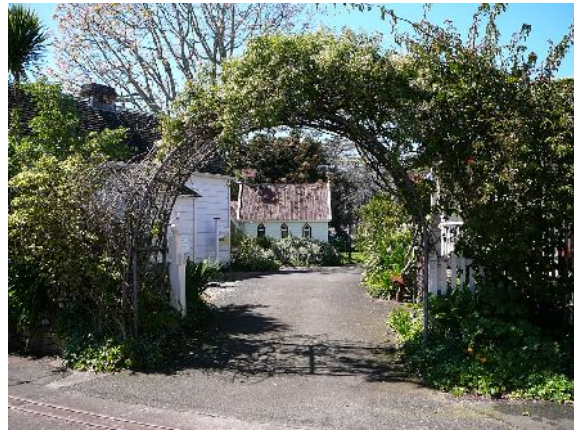
MOTAT Village entry 2007