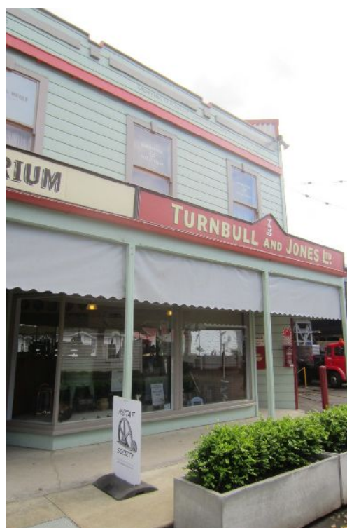
MOTAT's Turnbull and Jones Ltd shop, the Society's new base from June 2013.

If you have any interesting information about the MOTAT society or the formation or