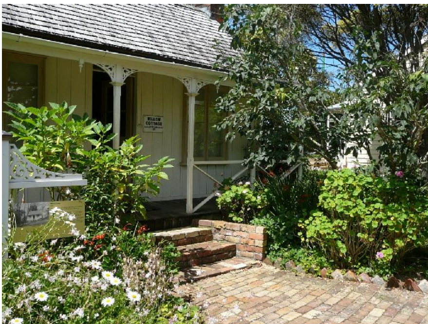
MOTAT's Willow Cottage 2006

* If you would like to know more about Oriel, who sadly passed away in 2011, see the 'Oriel Bickerton' article on page 23 of the Driving Wheel, Issue 1 (Sep 2011) – available online in the magazine archive at www.motatsociety.org.nz