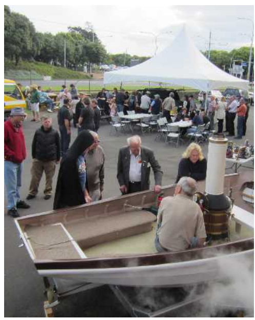
Steam Boat and Sausage Sizzle Marquee

On 10<sup>th</sup> November the MOTAT Society had a successful and well received event at the MOTAT Pumphouse. This was a bit of a social get together, as well as a chance for the Steam section to show off their work at the pumphouse and with various engines. In addition various external groups and individuals brought along engines and vehicles to display.