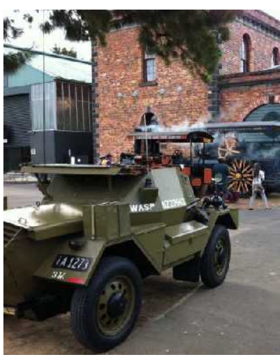
MOTAT Pumphouse with WASP

All up a couple of hundred people participated in some form and most people still at the museum came around to have a look at the engines on display and chat too. Things were getting setup/