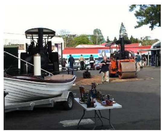
Steam Boat/Traction engine/Roller, model engines, and vintage cars in the background

We also had several trams running specifically for the event after 5pm and the last guests left between 8.30 and 9pm, leaving the steam section closing down the pumphouse.