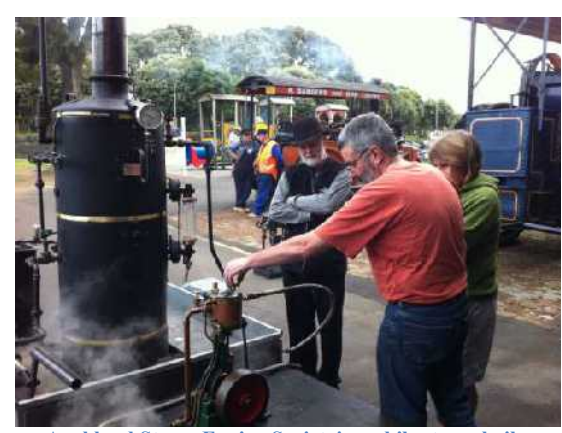
Auckland Steam Engine Society's mobile steam boiler with attached engine

going from about 3pm with the pumphouse and various engines steamed up (including a steam boat, various mini model engines, and larger engines from external people and the steam roller from MOTAT 2 and steam tram 100). Also there were a few classic cars, large and mini engines,