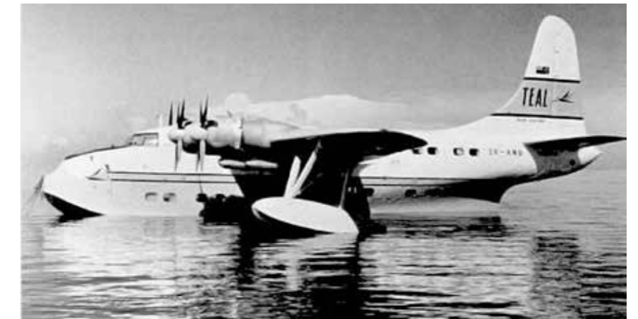
THE SOLENT AT REST ON THE WAITEMATA