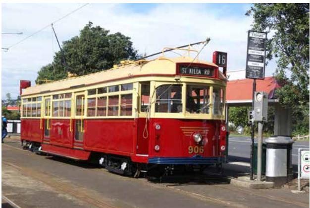
Many of you on the tours will have seen the restoration work being carried out on Tram No. 906, a SW6 design Melbourne & Metropolitan Tramways tram (where it operated 1945-1997). You may be interested to hear that the work was completed in August and on 2nd September she had her first test run (above), and should be going into service in the not too distant future.