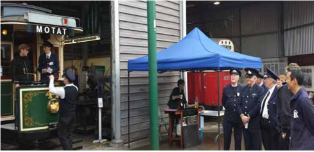
Tram section members look on proudly as Tram 44 gets ready for an outing, plus chef for the day Frances hard at work cleaning the BBQ!

heritage trams were taken out with many extra trams running off and on through the day, much to the enjoyment of other Museum visitors. The Sunbeam car club was also visiting the site that day, so there was plenty happening for all to see around the Museum on that day!