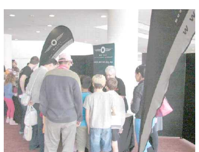
A view of our busy stall, with typesetting in the foreground.

You can check out another article on Print Section community outreach at Mangere Library through the newsletter page of our website (www.motatsociety.org.nz) or call Tessa (09)8156625 if you'd like a printed copy.