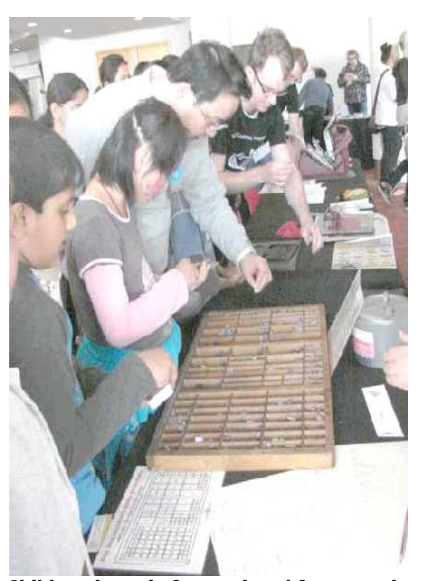
Children (mostly face-painted from another stall) composing their names in metal type.

The Storylines team were very appreciative of our presence. We were very grateful for them